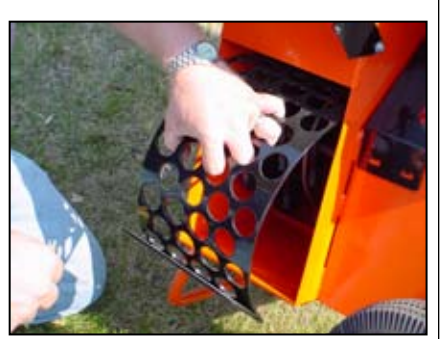
The Discharge Screen is easily removable making the change from screen to screen a breeze.